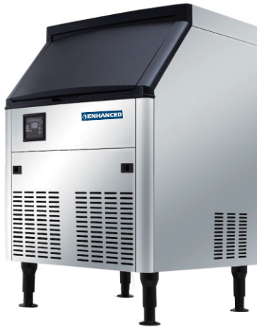
Model # ESK-219S