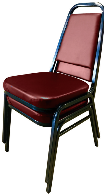
Black Frame - Wine Vinyl SL2082-WINE