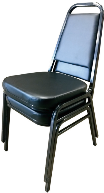
Black Frame - Black Vinyl SL2082-BLK