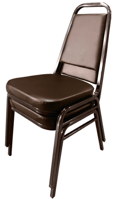
Brown Frame - Espresso Vinyl SL2082-ESP