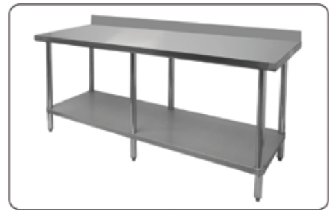
* 72" and up models have 6 legs