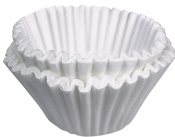
FILTERS.REGULAR1M 500/2 50/CL